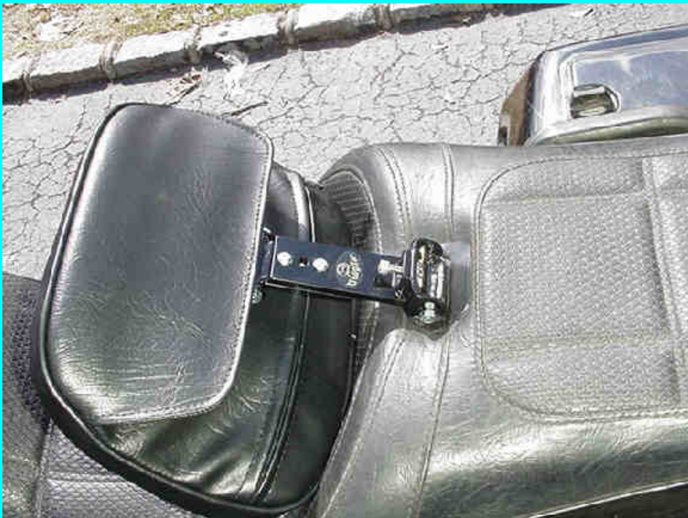
showing bracket, with pouch removed.